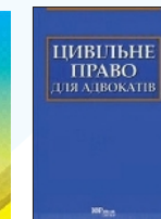
Learning manuals on civil law for judges, defense lawyers and notaries