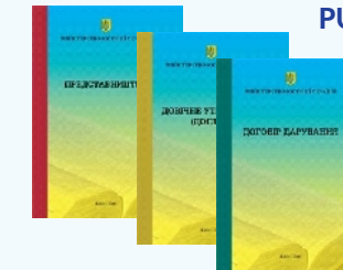
Brochures on civil law for the public