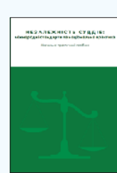
Informational and teaching handbooks on international standards of judicial independence