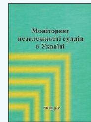
Results of yearly monitoring of judicial independence in Ukraine