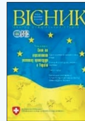
CJS Newsletters on the Project